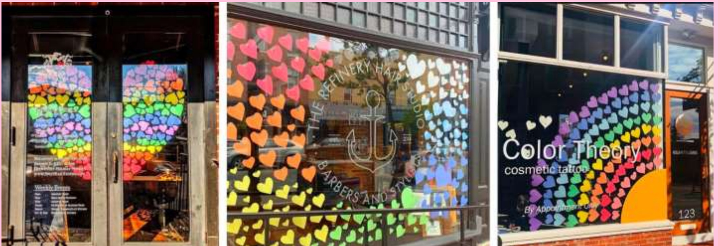
Main Street communities across the nation are showing some love

Historic Tax Credit applications are due Wednesday, April 29th!!!